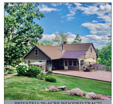
PRIVATE 1.20-ACRE WOODED TRACT!