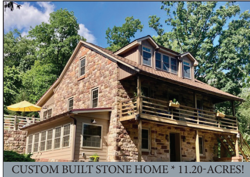
CUSTOM BUILT STONE HOME * 11.20-ACRES!