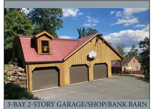
3-BAY 2-STORY GARAGE/SHOP/BANK BARN