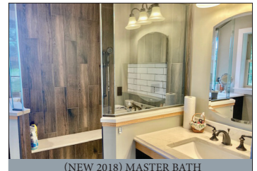
(NEW 2018) MASTER BATH