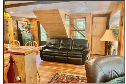
IN-LAW SUITE FAMILY ROOM