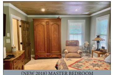
(NEW 2018) MASTER BEDROOM