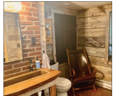
IN-LAW SUITE FULL BATH