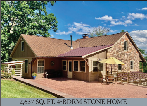
2,637 SQ. FT. 4-BDRM STONE HOME

4-BDRM 3.5-BATH COLONIAL STYLE STONE HOME * 11.20-ACRE TRACT! IN-LAW SUITE APARTMENT * 3-BAY 2-STORY GARAGE/BANK BARN SATURDAY, AUGUST 8, 2026 @ 10:00 AM