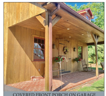
COVERED FRONT PORCH ON GARAGE