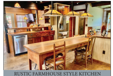
RUSTIC FARMHOUSE STYLE KITCHEN

ON-LINE & ONSITE BIDDING AVAILABLE * BROKER PARTICIPATION OFFERED