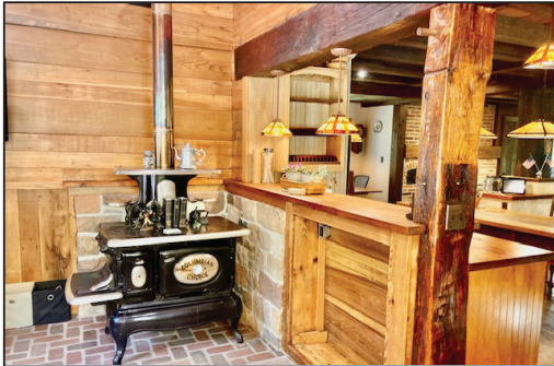
BRICK FLOOR ENCLOSED PORCH