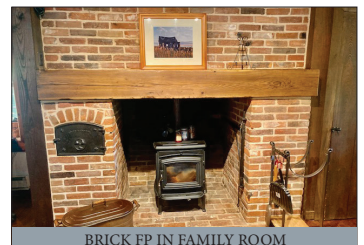
BRICK FP IN FAMILY ROOM