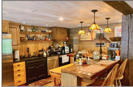
IN-LAW SUITE 2ND KITCHEN