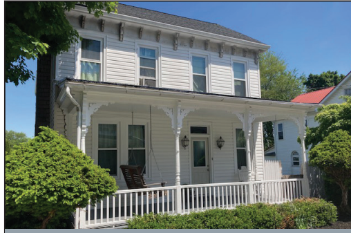
3-BDRM 2-BATH HOME * .37-AC. LOT