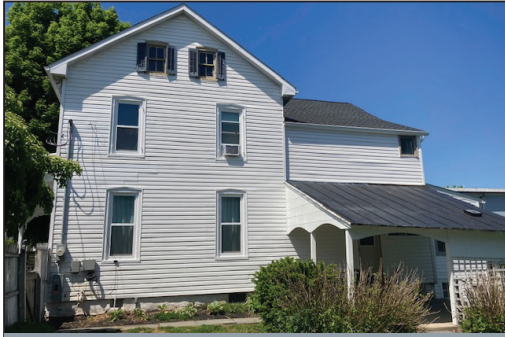
1,810 SQ. FT. COLONIAL STYLE HOME