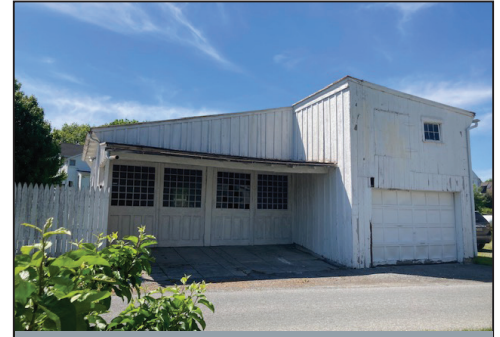
3-BAY CARRIAGE HOUSE STYLE GARAGE

Located at 416 Maple St. Terre Hill, Pa. 17581