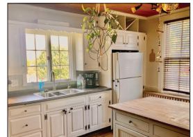
NICE UPGRADED KITCHEN