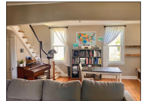
LIVING RM W/OPEN STAIRCASE