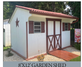
8'X12' GARDEN SHED