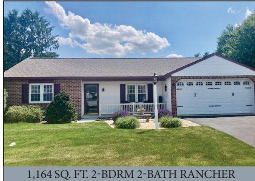
1,164 SQ. FT. 2-BDRM 2-BATH RANCHER