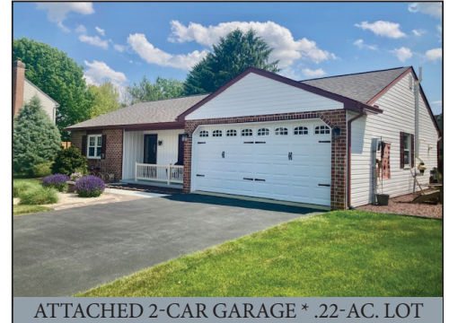
ATTACHED 2-CAR GARAGE * .22-AC. LOT

Directions: From Rt. 23 (Main St.) New Holland take S. Custer Ave. to right on Fulton St. to left on Zwecker to home on left.