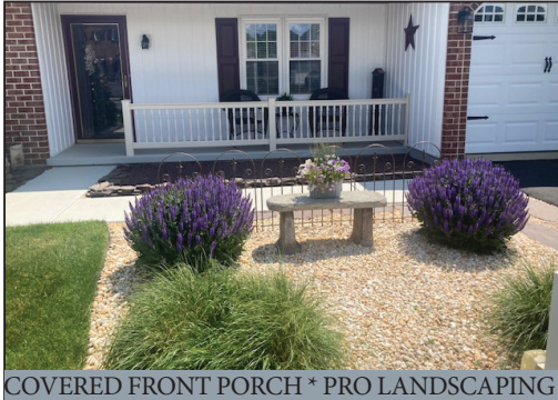
COVERED FRONT PORCH * PRO LANDSCAPING

Located at: 228 Zwecker Circle, New Holland, Pa. 17557