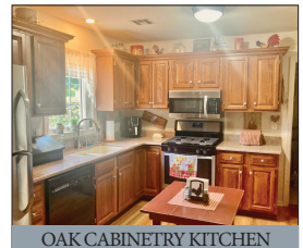
OAK CABINERY KITCHEN

Real Estate: consist of a 1,164 sq. ft. (1989) brick & vinyl rancher w/2-car garage & utility shed on a .22-acre level corner lot. Home features an 11'x15' Oak cabinetry kitchen w/SS fridge, DW, gas range & microwave; open to 10'x11' dining room w/vinyl plank flooring, patio doors to covered 9'x9' back porch w/PVC trim; 18'x13.5' living room w/wide front window & closet; 6.5'x7.5' main bath; BR #1) 13'x13' w/closet & private bath; BR #2) 13.5'x12.5' w/closet; 5'x11' utility room/laundry w/Speed Queen washer & dryer, gas furnace/central AC; gas water heater; radon mitigation system; attached 21'x17.5' 2-car garage; covered 18'x5' front porch w/PVC trim; insulated windows, newer shingled roof, 8'x12' utility shed; professional landscaping w/river stones; quaint shaded fire-pit area; public gas, water & sewer; nice wide macadam driveway; annual taxes: $3,363.