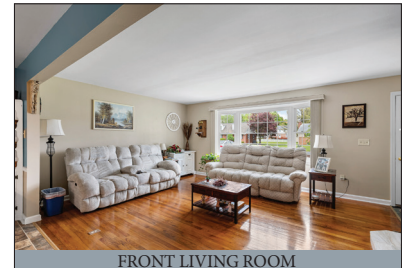
FRONT LIVING ROOM

Please visit our website www.martinandrutt.com or Facebook or Instagram