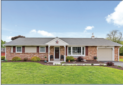
VERY NICE RANCHER

FANTASTIC TOTALLY REMODELED RANCHER * 3-BR's .38-ACRE * ATTACHED GARAGE & DETACHED SHOP IN-LAW QUARTERS * ALL-SEASON ROOM * PATIO SATURDAY JUNE 13, 2026 @ 10:00 AM