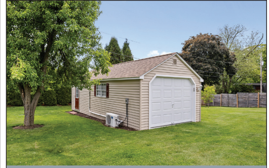
12' X 28' GARAGE SHED

LOCATED AT: 56 Timberline Dr. Leola, PA * Upper Leacock Twp.