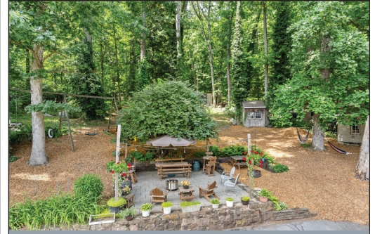
FANTASTIC PICNIC AREA

LOCATED AT: 340 Ridge Ave. Ephrata, PA * Ephrata Twp.