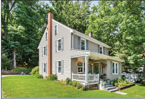
CLEAN HOUSE & PROPERTY

VERY CLEAN 2.5-STORY HOUSE & 2-STORY GARAGE .63-ACRE LOT * OUTDOOR ENTERTAINMENT AREA CLEAN COUNTRY-RUSTIC STYLE * MINI-SPLIT A/C MONDAY JULY 20, 2026 @ 6:30 PM