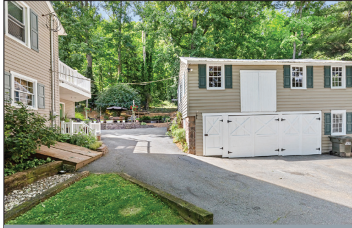
DETACHED 2-LEVEL GARAGE