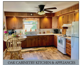
OAK CABINETRY KITCHEN & APPLIANCES