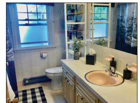
MAIN BATH W/TUB/SHOWER COMBO