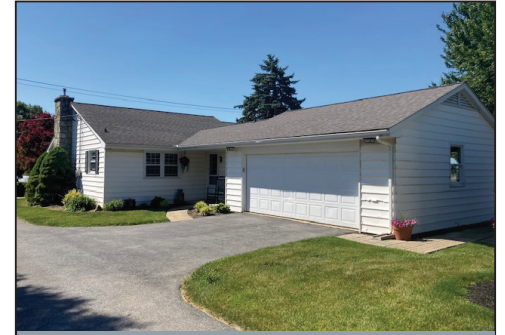
ATTACHED 2-BAY GARAGE & ALCOVE

Located at 640 Spruce Rd. New Holland, Pa. Earl Twp. Lancaster Co.