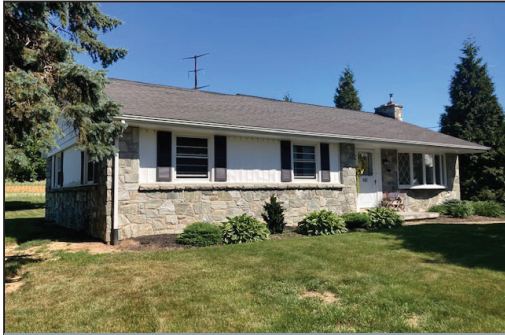
1,678 SQ. FT. 3-BDRM RANCHER

3-BDRM 1.5 BATH STONE RANCHER * .50-ACRE LOT ATTACHED 2-CAR GARAGE * 10'x14' UTILITY SHED FRIDAY, JULY 24, 2026 @ 6:30 PM