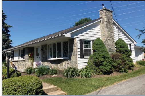
3-BDRM STONE RANCHER * .50-AC. LOT