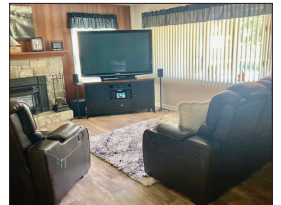
LIVING ROOM W/FP & BAY WINDOW