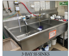
3-BAY SS SINKS