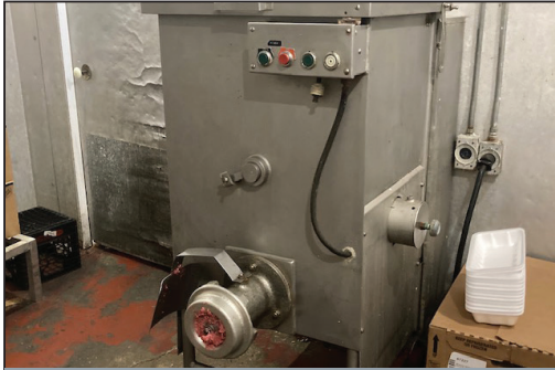
BIRO MEAT GRINDER/MIXER

Preview Dates: Sat. May 30 & June 6 from 1-3 PM