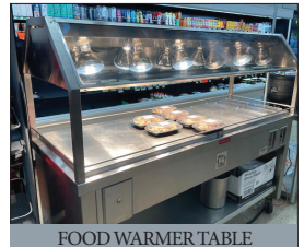
FOOD WARMER TABLE