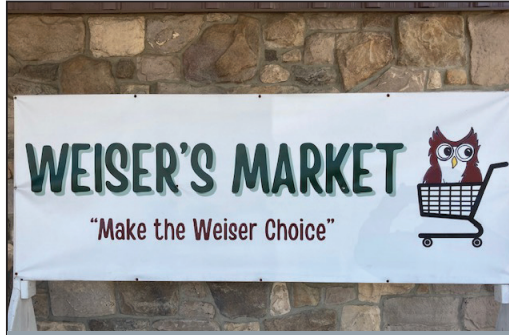
COMPLETE LIQUIDATION AUCTION