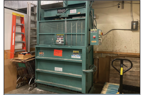
HYDRAULIC CARDBOARD BALER