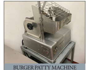
BURGER PATTY MACHINE