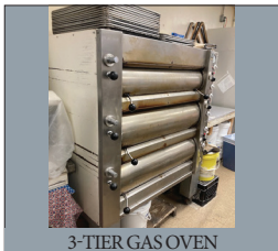
3-TIER GAS OVEN

Located at: 680 Furnace Hills Pk. Lititz, Pa. From Newport Rd./501 take 501 S. to right at auction Weiser's Mkt.