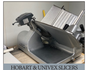
HOBART & UNIVEX SLICERS