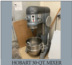
HOBART 30-QT. MIXER

Terms: Cash, PA check, Credit Card w/3% fee; Good Food provided