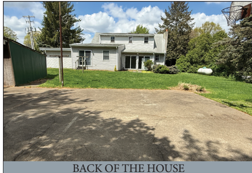
BACK OF THE HOUSE