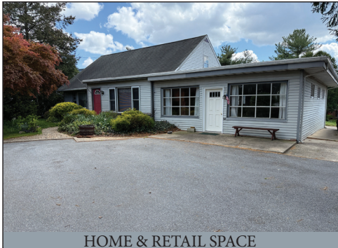
HOME & RETAIL SPACE

LARGE 1.5-STORY CAPE-COD * 4-BR * BASEMENT RETAIL SPACE & LIVING SPACE * HIGH TRAFFIC COUNT .39-ACRE * ZONED INDUSTRIAL * PRIVATE BACKYARD THURSDAY MAY 28, 2026 @ 7:00 PM