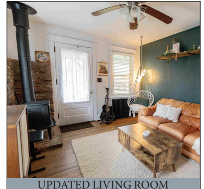
UPDATED LIVING ROOM