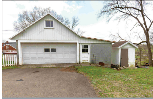
DETACHED 2-CAR GARAGE