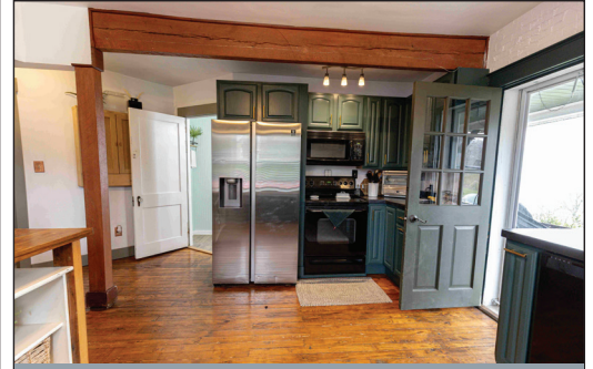
CHARMING UPDATED KITCHEN

LOCATED AT: 235 N. King St. Denver, PA 17517 * West Cocalico Township