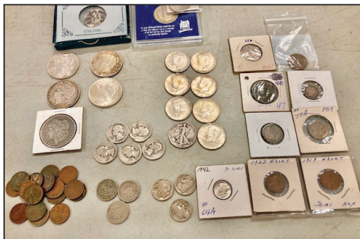
SAMPLE OF SILVER COINS

3-BDRM CUSTOM BRICK RANCHER w/GARAGE * .30-AC. LOT SILVER COINS * GUNS * ANTIQUES * TOOLS* FURNITURE 50+ WINROSS TRUCKS & FARM TOYS * PERSONAL PROPERTY SAT. MAY 30, 2026 @ 9-AM/Real Estate @ 1-PM