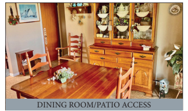
DINING ROOM/PATIO ACCESS