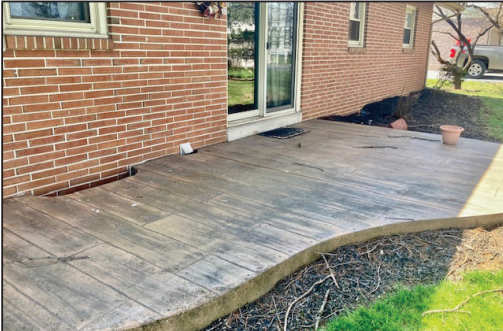
STAMPED CONCRETE REAR PATIO

3-BDRM CUSTOM BRICK RANCHER w/GARAGE * .30-AC. LOT SILVER COINS * GUNS * ANTIQUES * TOOLS* FURNITURE 50+ WINROSS TRUCKS & FARM TOYS * PERSONAL PROPERTY SAT. MAY 30, 2026 @ 9-AM/Real Estate @ 1-PM