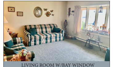
LIVING ROOM W/BAY WINDOW