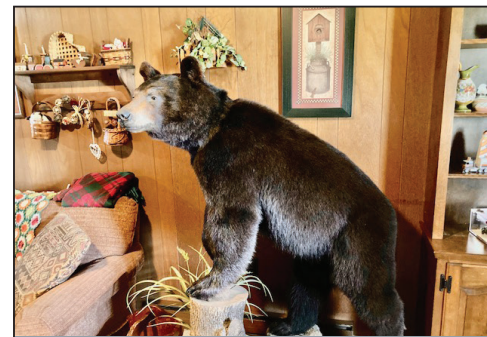
FULL MOUNT BLACK BEAR

Silver Coins @ 9-AM: 19-Lots of silver dollars; halves; quarters; dimes; framed state quarter set; etc.