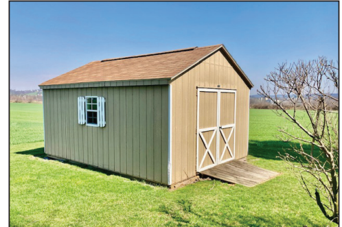
10'X16' UTILITY SHED * .30-ACRE LOT

Located at: 945 Quarry Rd. New Holland, Pa. East Earl Twp. Lancaster Co.