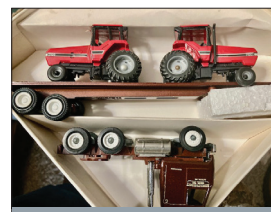
50+ WINROSS & FARM TOYS