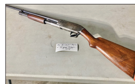
WINCHESTER #12 .12-GAUGE