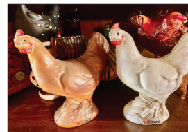
WEAVERS POULTRY CHICKENS