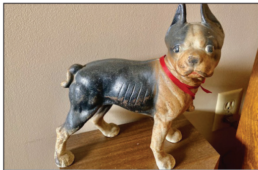
CAST IRON BULLDOG