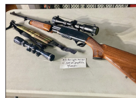
REMINGTON #760 .308 RIFLE

Terms: Cash, Pa. check or credit card w/3% fee, sale held under tent, bring a chair, good food provided.