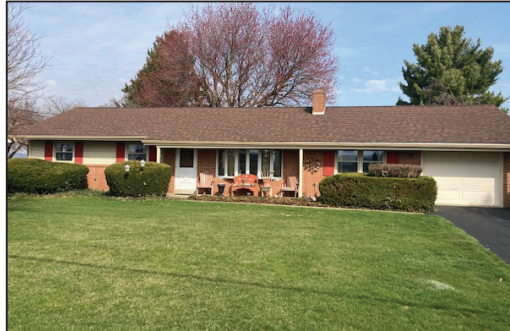
CUSTOM BRICK RANCHER W/GARAGE