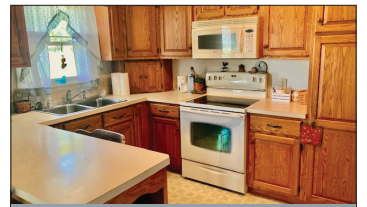
CUSTOM CABINETRY KITCHEN

Real Estate: consists of a custom built one-owner (1966) brick rancher w/garage & shed on a rural .30-acre lot! Main floor features an Oak cabinetry kitchen w/range, microwave, fridge & pantry, open to 13'x11' dining room w/patio access; spacious 29'x13' family room w/brick FP; 19'x14' living room w/bay window; covered front porch; full bath w/shower/tub combo; BR #1) 10.5'x13' w/closet; BR #2) 13'x11' w/closet; BR #3) 11.5'x11' w/closet; attached 372 sq. ft. 1-car garage; 1,247 sq. ft. basement w/laundry; 14'x14' 4 th bedroom or office; electric heat; on-site well & septic; newer roof & insulated windows; annual taxes: $3,376. Outbuilding: a 10'x16' frame utility shed.