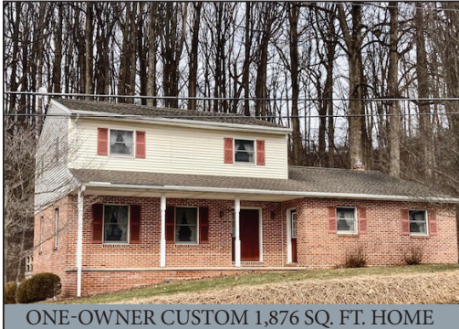
ONE-OWNER CUSTOM 1,876 SQ. FT. HOME