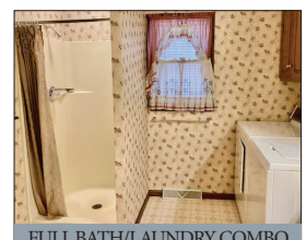
FULL BATH/LAUNDRY COMBO

OPEN HOUSE: SAT. APRIL 4 & 11 FROM 1-3 PM. For info call/text auctioneer @ (717) 371-3333.