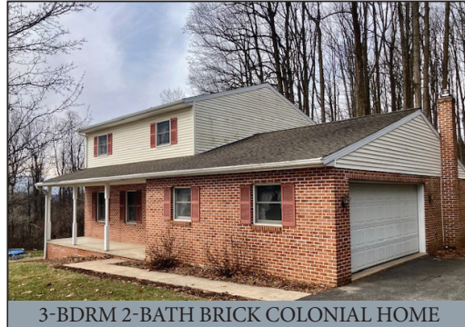
3-BDRM 2-BATH BRICK COLONIAL HOME