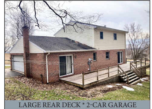
LARGE REAR DECK * 2-CAR GARAGE

Located at: 325 Whitehall Rd. Reinholds, Pa. W. Cocalico Twp. Lancaster Co.