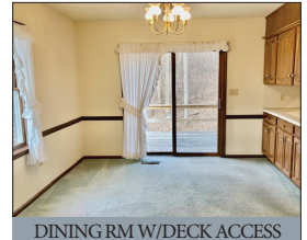
DINING RM W/DECK ACCESS