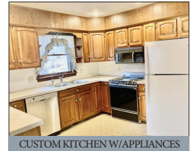
CUSTOM KITCHEN W/APPLIANCES