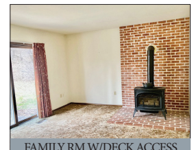
FAMILY RM W/DECK ACCESS