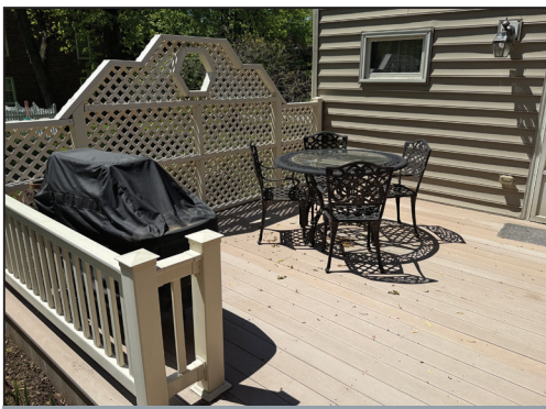
INVITING REAR DECK