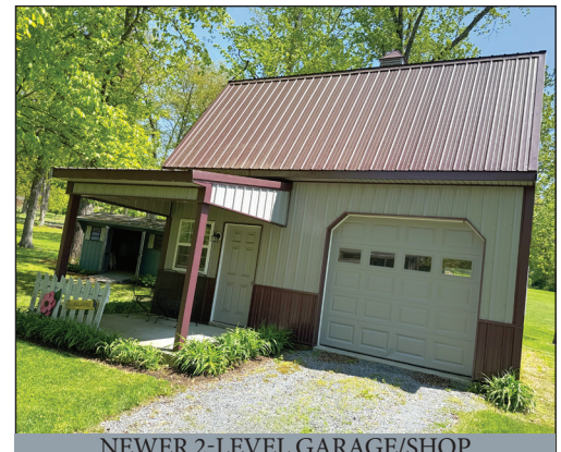
NEWER 2-LEVEL GARAGE/SHOP

TOOLS & GARAGE ITEMS: John Deere 325 lawn tractor w/ belly mower, front snowblower attach, (4) 25lb. suitcase weights & 1,050 hours; John Deere X300 lawn tractor w/ 42" mower deck & 390 hours; poly lawn cart; wheelbarrows; 10', 8', 6' fiberglass stepladders; Trac Vac leaf collection system; Troybilt S.P. mower; Weber gas grill; lawn spreader; propane tank; (2) iron spring chairs; Plumb axe; concrete birdbath; alum. patio table w/ 4 chairs; power tools; hose reel; gas cans; alum. 40' 26' & 20' ext. ladders; Stihl MS211C chainsaw in case; Echo blower/vac; 60k ready heater; air compressor; 2500 watt generator; ext. cords; live trap; pole saws; wrenches & screwdrivers; battery charger; alum. drywall bench; pump sprayer; 5-hp wood splitter; animal traps; runner sled; jack stands; Craftsman stacking toolchest; planters; bench grinder; watering cans; Makita angle grinder; scrap lumber; hand tools; Shop vac; plus more.