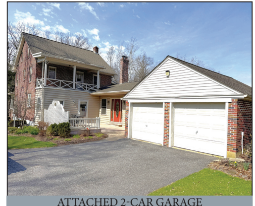
ATTACHED 2-CAR GARAGE

LOCATED AT: 1672 Reading Rd. Mohnton Pa. * Brecknock Twp. Lanc. County