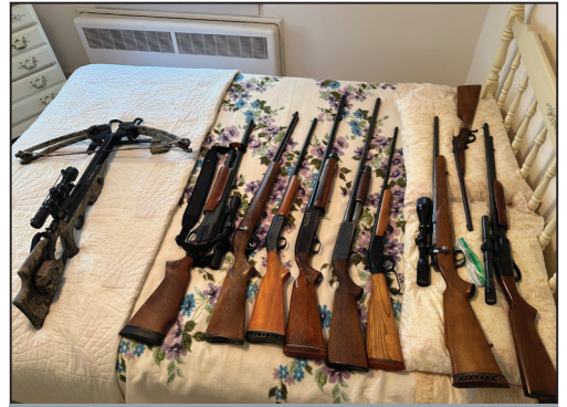
PERSONAL GUN COLLECTION