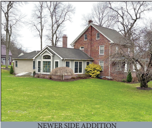
NEWER SIDE ADDITION

4-BR BRICK 2.5-STORY HOUSE w/ SIDE ADDITION .85-ACRE * DETACHED SHOP & ATTACHED GARAGE PERSONAL PROP. * GUNS * SILVER COINS * TOOLS SAT. JUNE 27, 2026 @ 8:30 AM * R.E. @ 1-PM