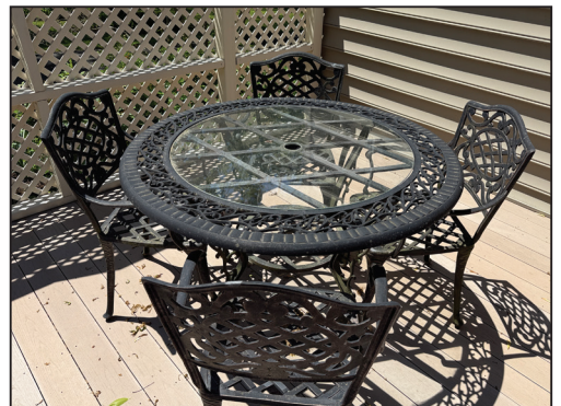
ALUM. PATIO SET

PERSONAL PROPERTY: Newer Frigidaire 22 cf. upright freezer; newer GE washer & dryer; AFG treadmill; Reclining sofa & loveseat; 1 dr. sofa table; two club chairs; set of (4) Ebersole chairs, blanket & Cedar chests; NSF shelf; glider rocker and stool; solid cherry china cabinet by Colonial; 3-piece white bedroom suite; Kemper Brethren church benches; wingback chair; clothes tree; nice wall pictures; dehumidifier; fishing rods & tackle; deep-sea rod; old feed-sack material; fans; 3 boxes of records; Century safe; Ertl Allis Chalmers toy tractor; Structo dump truck; 1980's-2000's baseball cards; paper shredder; assorted glassware; household items.