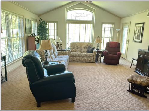
LIVING ROOM ADDITION