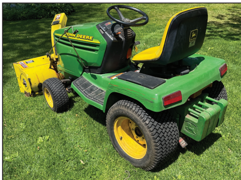
(2) JOHN DEERE TRACTORS