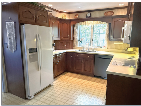
CUSTOM CHERRY KITCHEN