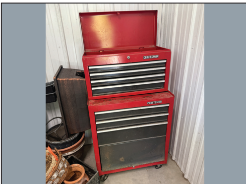
STACKING TOOL CHEST