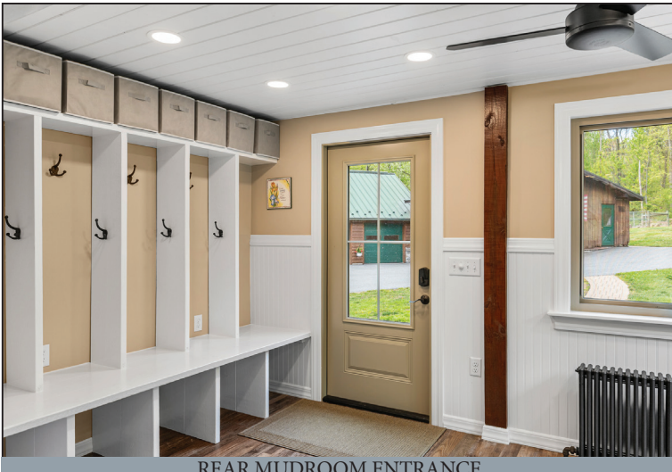
REAR MUDROOM ENTRANCE