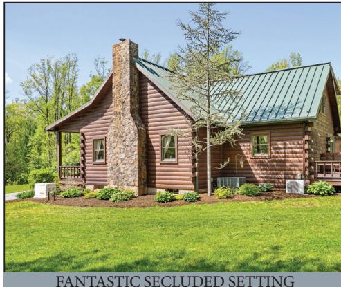
FANTASTIC SECLUDED SETTING