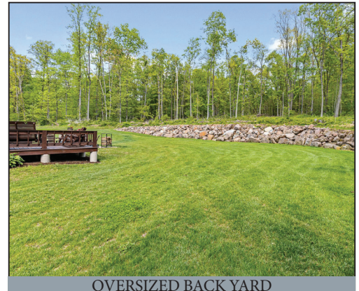
OVERSIZED BACK YARD

LOCATED AT: 491 Sheep Hill Rd. Newmanstown PA * Heidelberg Twp.