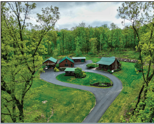
SHOWS BUILDING PLACEMENT