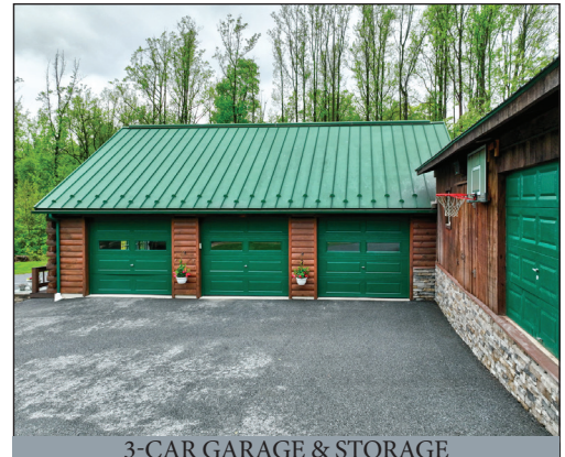
3-CAR GARAGE & STORAGE