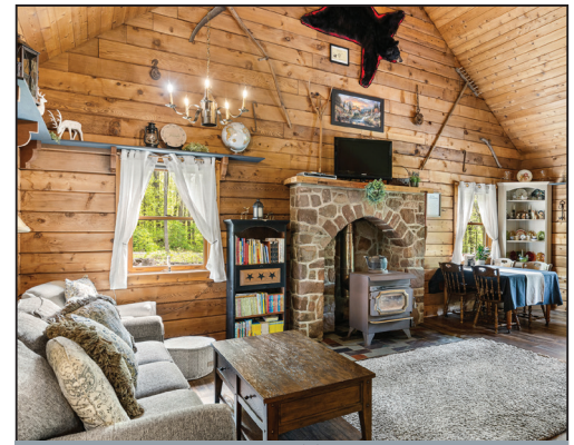
CHARMING FRONT LIVING ROOM