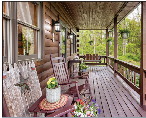
INVITING FRONT PORCH