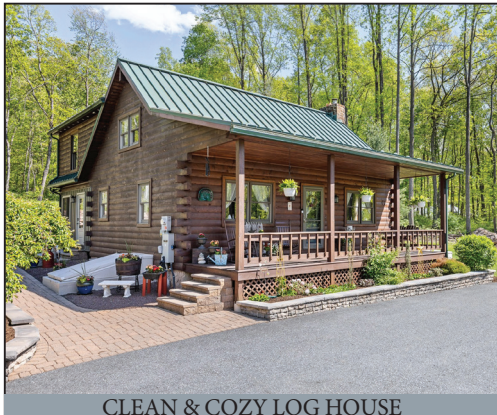
CLEAN & COZY LOG HOUSE

11.93-ACRE WOODED LOT * PASTURE & ANIMAL BARN STUNNING CUSTOM LOG HOUSE * 3-BR * 3-CAR GARAGE SET BACK FROM THE ROAD * USABLE OUT-BUILDINGS THURSDAY JUNE 18, 2026 @ 7:00 PM