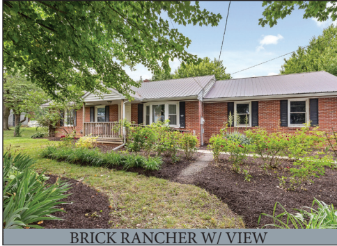
BRICK RANCHER W/ VIEW

3-BR BRICK RANCHER * VIEW FROM REAR DECK .44-ACRE LEVEL LOT * 2-CAR ATTACHED GARAGE FINISHED BASEMENT * HOUSE NEEDS RENOVATION TUESDAY JULY 21, 2026 @ 6:00 PM