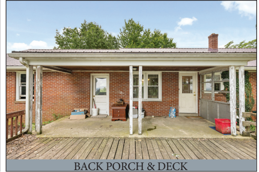
BACK PORCH & DECK