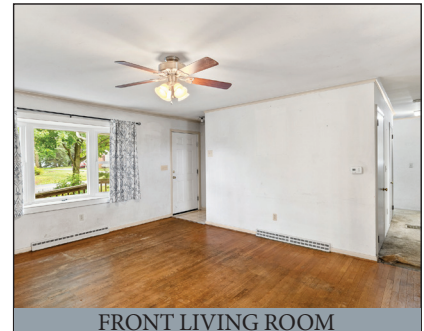
FRONT LIVING ROOM

OFFERING BROKER PARTICIPATION TO REGISTERED AGENTS