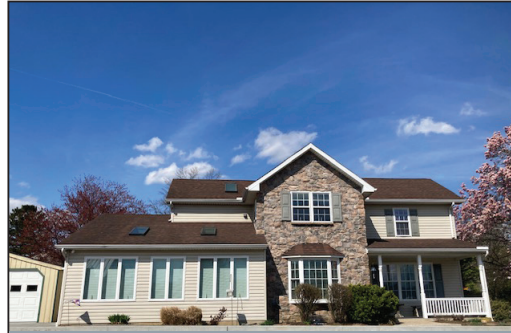
2,233 SQ. FT. 2-UNIT RENTAL HOME