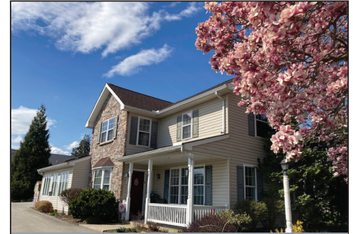
PDATED 2-STORY 2-UNIT * .22-AC. LOT

Located at: 8 & 10 N. Kinzer Rd. Kinzers, Pa. Paradise Twp. Lancaster Co.