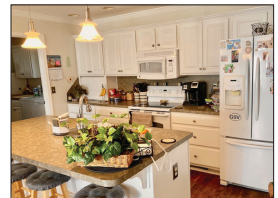
UNIT #1 KITCHEN W/BAR

For Photos & Details Visit www.martinandrutt.com