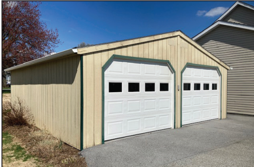
DETACHED 2-CAR GARAGE/SHOP

VALUABLE 2-UNIT 2-STORY RENTAL PROPERTY * .22-AC TOTALLY UPDATED 2006 * 2-CAR GARAGE * GARDEN SHED THURSDAY, MAY 21, 2026 @ 6:00 PM