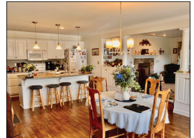
UNIT #1 DINING AREA