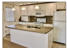
UNIT #2 KITCHEN W/BAR