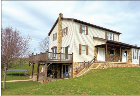
3 OR 4 BEDROOM COLONIAL