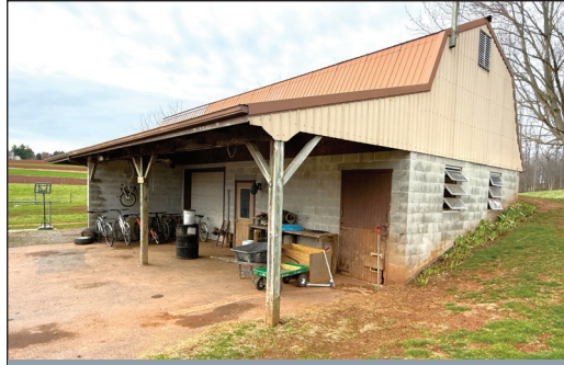
SHOP & HORSE BARN