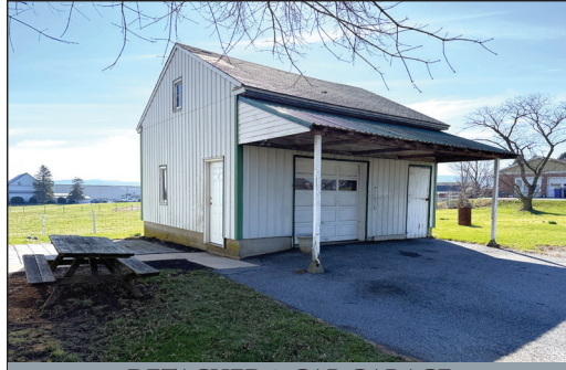
DETACHED 2-CAR GARAGE