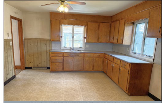
CHARMING UPDATED KITCHEN

LOCATED AT: 107 Ewell Rd. East Earl, PA * East Earl Twp.