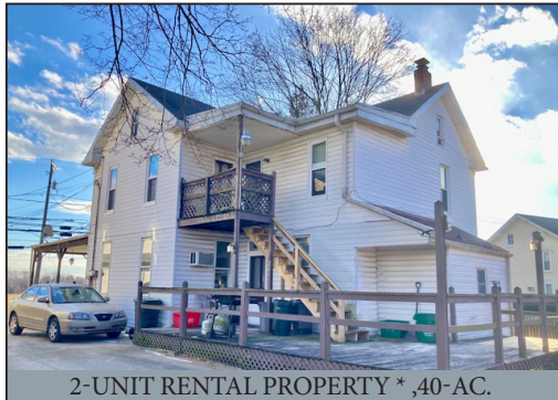
2-UNIT RENTAL PROPERTY *, .40-AC.

VALUABLE 2-UNIT RENTAL/INVESTMENT * .40-ACRE LOT! 2020 Sq. Ft. TRADITIONAL 2-STORY HOME & 2-STORY BARN THURSDAY, MARCH 12, 2026 @ 4:00 PM