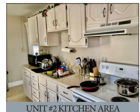
UNIT #2 KITCHEN AREA

FOR PHOTOS & DETAILS VISIT www.martinandrutt.com