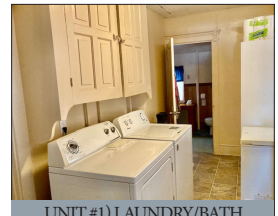
UNIT #1) LAUNDRY/BATH