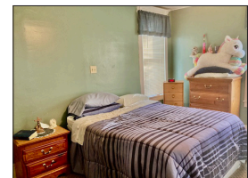
UNIT #1) PRIMARY BDRM