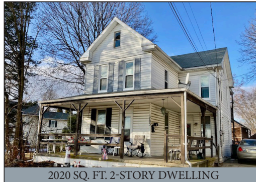
2020 SQ. FT. 2-STORY DWELLING