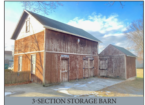
3-SECTION STORAGE BARN

Located at: 1703 Old Rothsville Rd. Lititz, Pa. 17543 Warwick Twp. Lancaster Co.