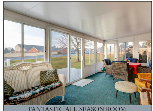
FANTASTIC ALL-SEASON ROOM