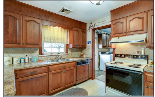
NEWER MAPLE KITCHEN

LOCATED AT: 440 Ranck Rd. New Holland, PA 17557 * Garden Spot School District