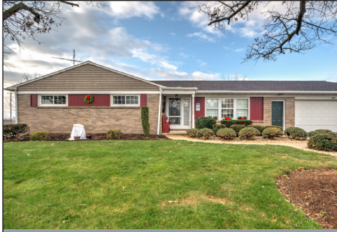
3-BR BRICK RANCHER

3-BEDROOM BRICK RANCHER * .46-ACRE LEVEL LOT * 2-CAR GARAGE * FULL BASEMENT CLEAN * NICE KITCHEN * ALL-SEASON ROOM SAT. FEBRUARY 28, 2026 @ 11:00 AM