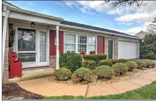
INVITING FRONT WALKWAY