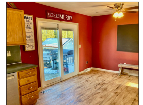
OPEN TO DINING AREA