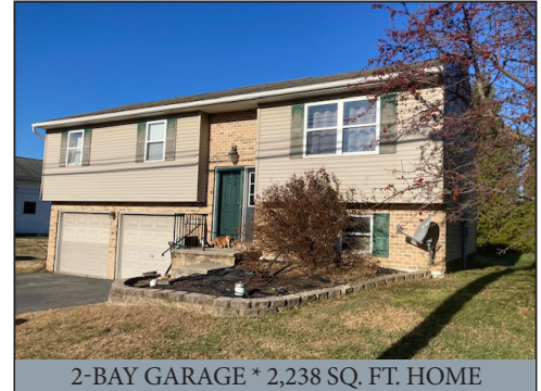
2-BAY GARAGE * 2,238 SQ. FT. HOME

Located at: 1329 Sheep Hill Rd. East Earl, PA East Earl Twp. Lancaster Co.