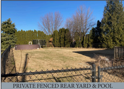
PRIVATE FENCED REAR YARD & POOL

3-BDRM 2-BATH 2,238 Sq. Ft. BI-LEVEL HOME * .17-AC. LOT ATTACHED 2-BAY GARAGE * REAR DECK * CENTRAL A/C THURSDAY, FEBRUARY 12, 2026 @ 4:00 PM