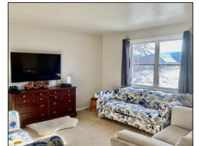
LIVING ROOM W/BAY WINDOW