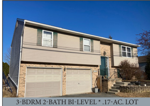
3-BDRM 2-BATH BI-LEVEL * .17-AC. LOT