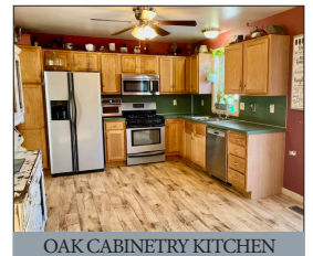
OAK CABINETRY KITCHEN

For photos & detailed listing visit www.martinandrutt.com