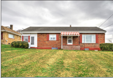
3-BR BRICK RANCHER

3-BEDROOM BRICK RANCHER * .56-ACRE VIEW IN BACK * 2-CAR DETACHED GARAGE CLEAN * NEEDS COSMETIC UPDATES THURSDAY MARCH 26, 2026 @ 5:00 PM