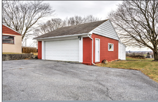
DETACHED 2-CAR GARAGE