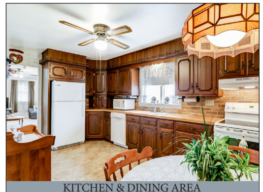
KITCHEN & DINING AREA