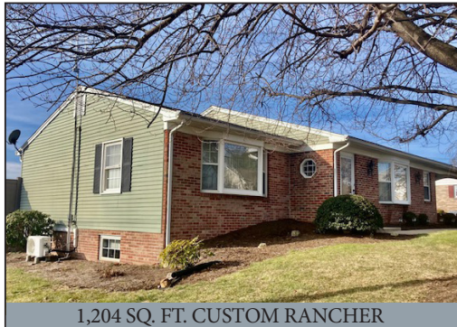
1,204 SQ. FT. CUSTOM RANCHER

SAT. APRIL 18, 2026 @ 9-AM/Real Estate @ 11-AM