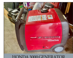
HONDA 3000 GENERATOR