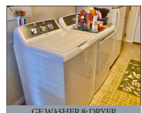
GE WASHER & DRYER