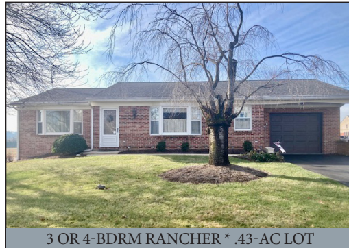
3 OR 4-BDRM RANCHER * .43-AC LOT