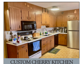
CUSTOM CHERRY KITCHEN

Terms: Cash, PA check or credit card w/3% fee; sale held under tent, bring a chair, food by GSFR aux.