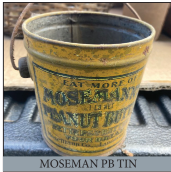
MOSEMAN PB TIN