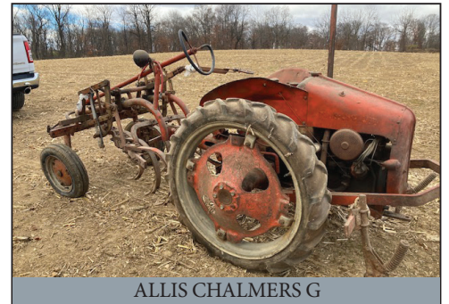
ALLIS CHALMERS G