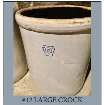
#12 LARGE CROCK