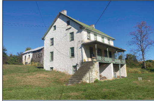
3-BDRM STONE FARMHOUSE