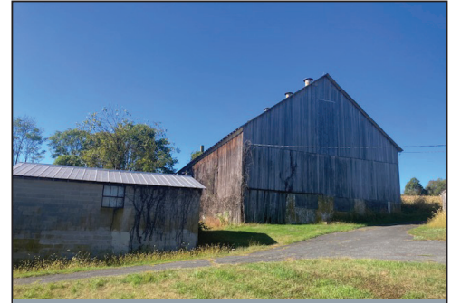
BANK BARN & OUTBUILDINGS

Located at: 380 Kauffroth Rd. Gap. PA 17527 Salisbury Twp. Lancaster Co.