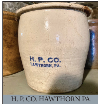
H. P. CO. HAWTHORN PA.