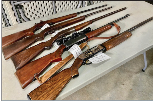
RIFLES & SHOTGUNS

137.2-ACRE FARM * 99-AC. TILLABLE * 38.2-AC. WOODED 3-BDRM FARMHOUSE * BANK BARN * TOBACCO & EQUIPMENT BARN A/C TRACTORS * FARM EQUIP * GUNS * RARE ANTIQUES & PRIMITIVES SAT., JAN. 17, 2026 @ 9:00 AM /Real Estate @ NOON