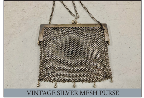
VINTAGE SILVER MESH PURSE