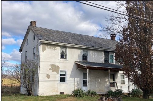
1800'S 4-BDRM FARMHOUSE