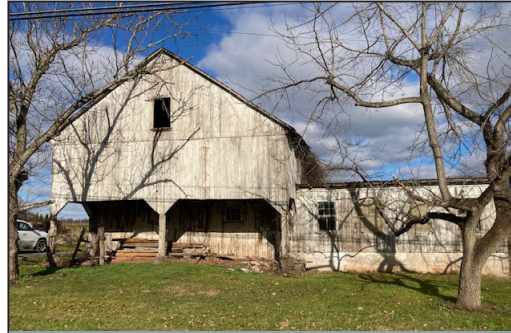
3-STALL 2-STORY HORSE BARN