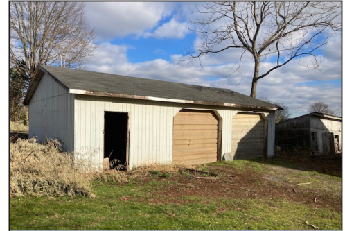
24'X36' 2-BAY GARAGE/SHOP