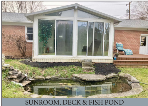
SUNROOM, DECK & FISH POND

3-BDRM 1-BATH BRICK RANCHER * .35-ACRE LOT FINISHED FAMILY ROOM * 1-CAR GARAGE * KOI POND THURSDAY, JANUARY 22, 2026 @ 4:00 PM