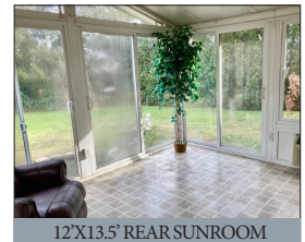
12'X13.5' REAR SUNROOM

For photos & detailed listing visit www.martinandrutt.com