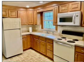
MAPLE CABINETRY KITCHEN