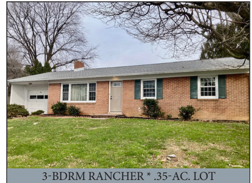
3-BDRM RANCHER * .35-AC. LOT

Located at: 181 Eastbrook Rd. (Rt. 896) Smoketown, Pa. E. Lampeter Twp. Lancaster Co.