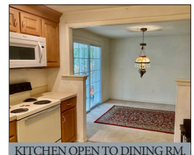
KITCHEN OPEN TO DINING RM.