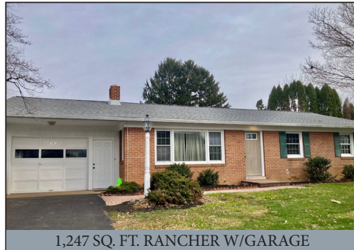
1,247 SQ. FT. RANCHER W/GARAGE