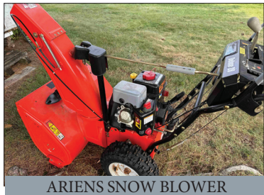
ARIENS SNOW BLOWER

Offering Broker Participation to Registered Brokers