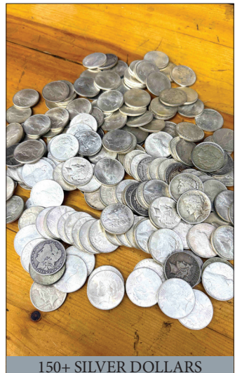
150+ SILVER DOLLARS