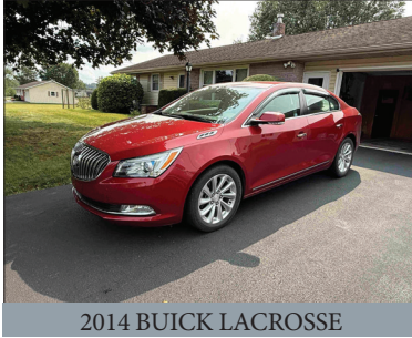
2014 BUICK LACROSSE

CLEAN 3-BR RANCHER * .73-ACRE LEVEL LOT 2-CAR ATTACHED GARAGE * LOW-TRAFFIC ROAD VEHICLES * FURNITURE * TOOLS * FORD 8-N TRACTOR SATURDAY NOV. 1, 2025 @ 8:30 AM * R.E @ 1-PM