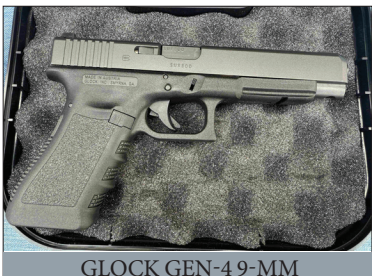
GLOCK GEN-4 9-MM