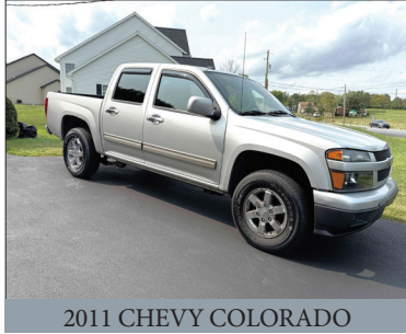
2011 CHEVY COLORADO