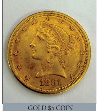
GOLD $5 COIN