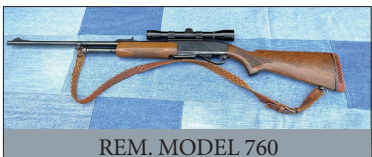
REM. MODEL 760