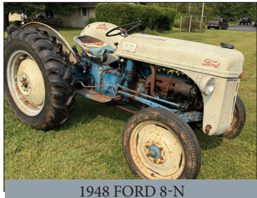
1948 FORD 8-N

trimmer; Delta 10" table saw; Jackson lawn cart; Ariens 21" S.P. mower; (2) cast iron troughs; old 12" iron post bell; old license plates; poly lawn roller; 2-hole corn sheller; bird bath; step ladders; old balance scales; 5-gal. crock; dog boot-scraper; galv. single rinse tub; (5) Ned Foltz redware plates; Pyrex bowls; knife carving set; lots of pretty glassware; sleds; more unlisted.