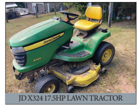
JD X324 17.5HP LAWN TRACTOR