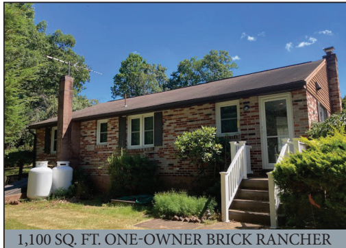
1,100 SQ. FT. ONE-OWNER BRICK RANCHER