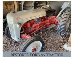
RESTORED FORD 8N TRACTOR

For photos & details visit www.martinandrutt.com