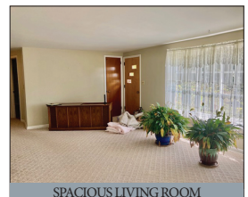
SPACIOUS LIVING ROOM