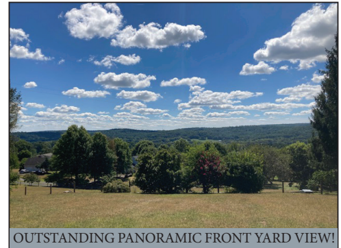
OUTSTANDING PANORAMIC FRONT YARD VIEW!

Located at 10 Millet Ln. Mohnton, Pa. Brecknock Twp. Berks Co.