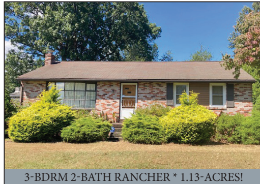
3-BDRM 2-BATH RANCHER * 1.13-ACRES!