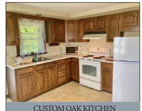
CUSTOM OAK KITCHEN