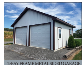
2-BAY FRAME METAL SIDED GARAGE