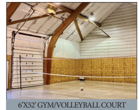
6'X52' GYM/VOLLEYBALL COURT