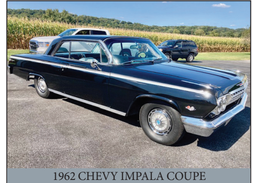
1962 CHEVY IMPALA COUPE

Terms: $100,000.00 down day of sale, balance in 60-days. Attorney: Glick, Goodley, Deibler & Fanning LLP (717) 354-7700.