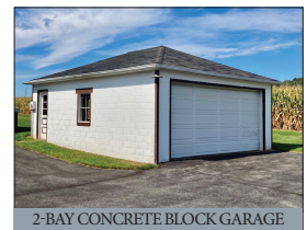
2-BAY CONCRETE BLOCK GARAGE