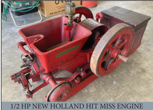
1/2 HP NEW HOLLAND HIT MISS ENGINE