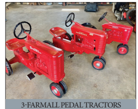
3-FARMALL PEDAL TRACTORS

TRACTOR, FARM EQUIPMENT & ANTIQUES: New Holland ½ hp hit-miss engine #5927 (nice!); (2) Kurtz Foundry binder tongue wheels; early New Holland grinder/mixer w/ original paint & stencil; detailed small replica sleigh, maroon w/gold trim; JD 955 4x4 DSL tractor 925hrs w/cab & 70A loader; 3-pt scraper; pallet forks; snow blade; Woods SB60 PTO snow blower; JD 7' 3-pt. sickle-bar mower; MX54 Woods F23 zero-turn mower w/power blower & catcher, 717hrs, (new engine); Maxi-Power 25kw PTO generator; walk-behind potato plow; mobile scaffolding set; 16' 7000GVW IH dual axle trailer; 1976 3000GVW EZ 6'x8' mulch trailer; STOELTING soft ice cream machine on SS cart (NICE!); 3-FARMALL pedal tractors!