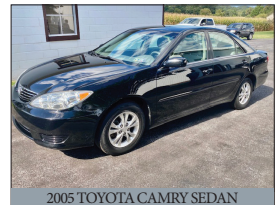
2005 TOYOTA CAMRY SEDAN