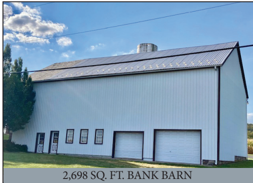
2,698 SQ. FT. BANK BARN