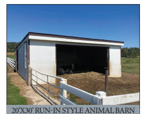
20'X30' RUN-IN STYLE ANIMAL BARN