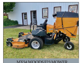
MX54 WOODS F23 MOWER