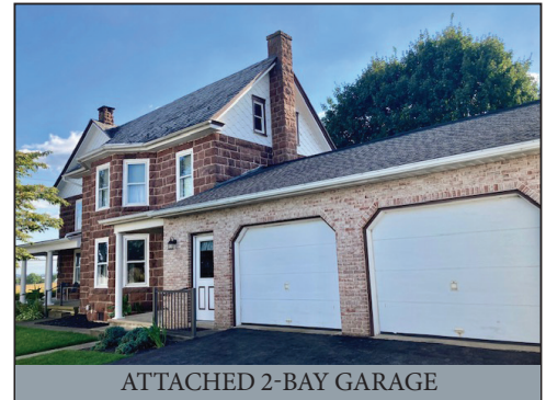
ATTACHED 2-BAY GARAGE

Located at: 38 Hahnstown Rd. Ephrata, Pa. Ephrata Twp. Lancaster Co.