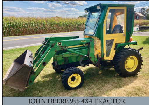
JOHN DEERE 955 4X4 TRACTOR