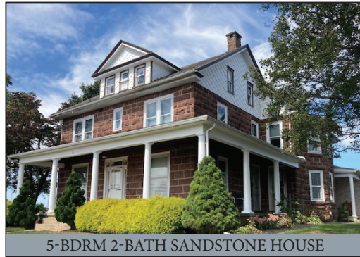
5-BDRM 2-BATH SANDSTONE HOUSE