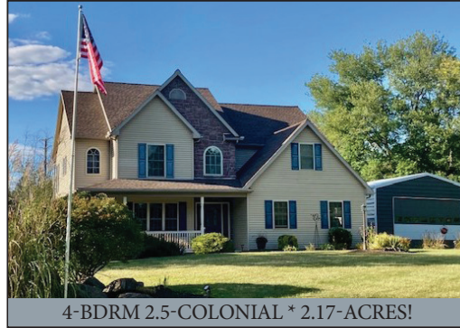
4-BDRM 2.5-COLONIAL * 2.17-ACRES!