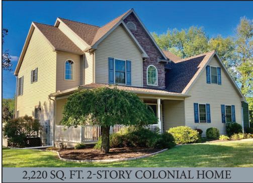
2,220 SQ. FT. 2-STORY COLONIAL HOME

4-BDRM 2.5-BATH 2,220 Sq. Ft. COLONIAL * 2.17-ACRES! DETACHED GARAGE/SHOP * UTILITY SHED * POOL & PATIO TUESDAY, OCTOBER 28, 2025 @ 5:00 PM