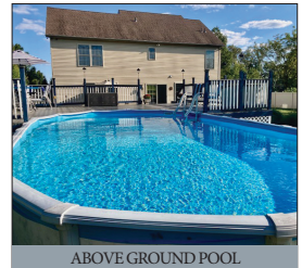
ABOVE GROUND POOL

For photos & detailed listing visit www.martinandrutt.com