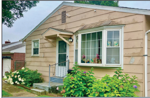
3-BDRM 1-BATH SPLIT-LEVEL HOME