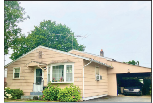
ATTACHED CARPORT * .19- ACRE LOT

Located at: 146 Keller Ave. Sinking Spring, PA 19608 * Berks Co. Wilson Schools