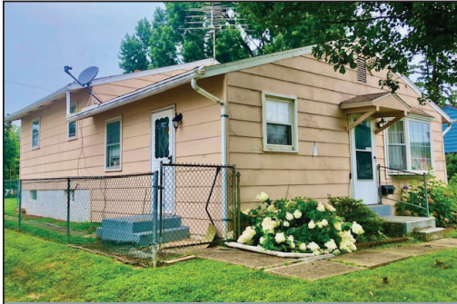
1,280 SQ. FT. (1960) SPLIT-LEVEL