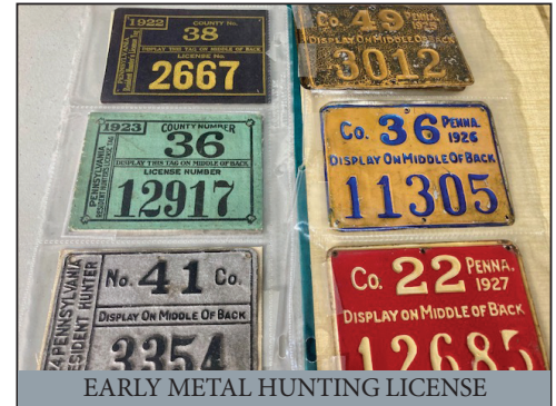
EARLY METAL HUNTING LICENSE

Auction Location: New Holland Fire Hall 339 E. Main St. New Holland, Pa. 17557