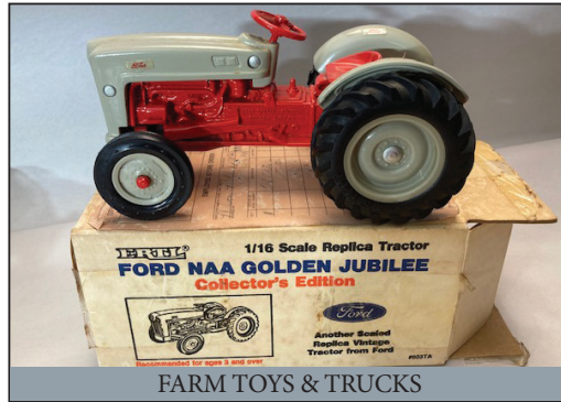
FARM TOYS & TRUCKS