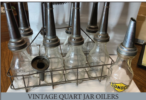
VINTAGE QUART JAR OILERS