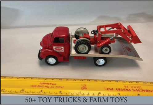
50+ TOY TRUCKS & FARM TOYS