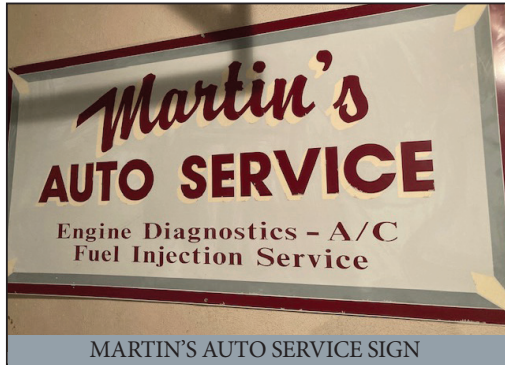
MARTIN'S AUTO SERVICE SIGN

MARTIN'S AUTO SERVICE * RAY MARTIN LIFETIME COLLECTION ANTIQUES * COINS * GUNS * PA GAME COMMISSION ITEMS * GAME PRINTS TOY TRUCKS & TRACTORS * TORO MOWER * LIBERTY FIRE CO MEMORABILIA SATURDAY, JANUARY 24, 2026 @ 8:00 AM