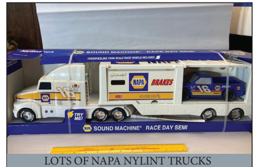
LOTS OF NAPA NYLINT TRUCKS