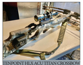
TENPOINT HLX ACU TITAN CROSSBOW