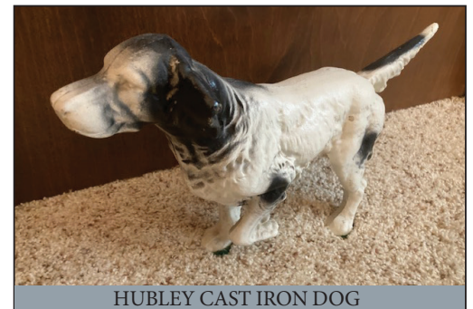
HUBLEY CAST IRON DOG

Lawn & Garden/Personal Property: Toro Z-turn 42" 22.5hp mower; Massey Ferguson 2614H lawn tractor w/snow blower; Stihl chainsaw; Dewalt 18V drill; Roto-Hoe chipper; 3-runner sleds; tobacco sizer; Campbell/Hausfield air compressor; bench grinder; Littlestown vise; ladders; shovels & hand tools; wheelbarrow; duck decoys; 2-T floor jack; express wagon; kids bikes; shop stools; Swiss cuckoo clock; tall case clock; 2-recliners; sofa; dinette table & 4 chairs; lighted curio; GE fridge; upright freezer; washer & dryer; china hutch; drysink; bedroom furniture; antique crocks & jugs; wooden bench; early comic books; Little Golden books; metal Advertising signs; Griswold pans; Hubley Pointer dog; Sentry safe; brass fire extinguisher; lots of Liberty Fire Co. memorabilia; Snap On wrench & socket collector sets; Zausner cheese boxes; 10-old glass oil jars & carrier; Zippo lighters & knives; arrowheads; Earl Twp map; cigar boxes; Martyrs Mirror; old ladles; marble roller; Cider Sign, Levi Good Mill, NH; etc.