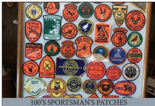
100'S SPORTSMAN'S PATCHES