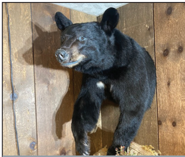
BLACK BEAR MOUNT