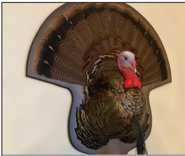
MOUNTED WILD TURKEY