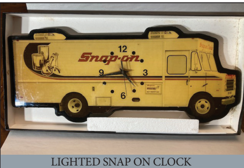
LIGHTED SNAP ON CLOCK