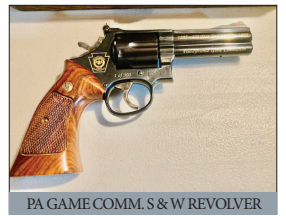
PA GAME COMM. S & W REVOLVER