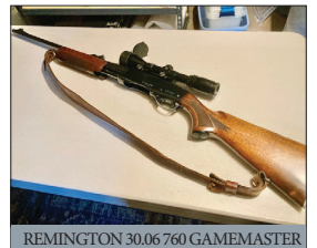
REMINGTON 30.06 760 GAMESMASTER