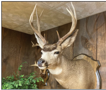
WHITETAIL BUCK MOUNT