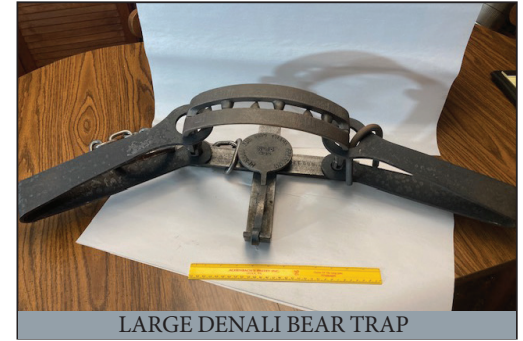
LARGE DENALI BEAR TRAP