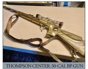
THOMPSON CENTER .50-CAL BP GUN