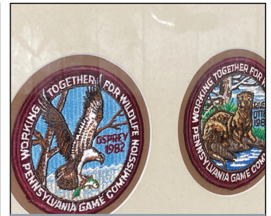
PA GAME COMMISSION PATCHES