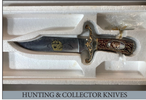
HUNTING & COLLECTOR KNIVES