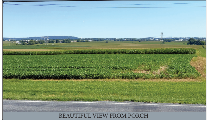
BEAUTIFUL VIEW FROM PORCH

LOCATED AT: 600 Clearview Rd. Ephrata, PA 17522