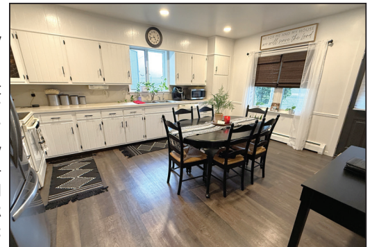
DESIRABLE EAT-IN KITCHEN