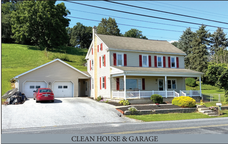
CLEAN HOUSE & GARAGE