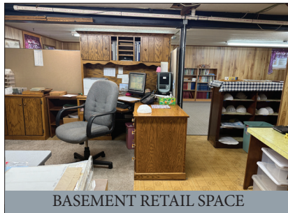
BASEMENT RETAIL SPACE

BRIEF TERMS: 10% down payment the day of auction, balance in 60-days. This auction is being held under the terms provided by Attorney Glick, Goodley, Deibler & Fanning 717-354-7700. This information has been provided as a courtesy to the buyer and is believed to be true/accurate, however buyer is responsible to verify any/all written information.