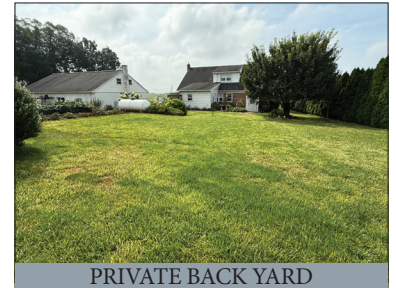
PRIVATE BACK YARD