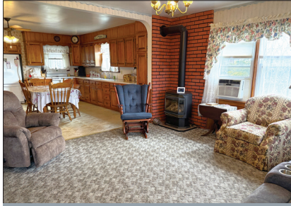
LIVING ROOM INTO KITCHEN

CLEAN BRICK CAPE-COD STYLE HOUSE * 5-BEDROOMS DETACHED GARAGE/SHOP * .56-ACRE LOT * SOUTH VIEW 100's OF BOOKS * HOUSEHOLD ITEMS * 5'x 8' TRAILER SATURDAY OCT. 18, 2025 @ 8:30 AM * R.E. @ 1-PM