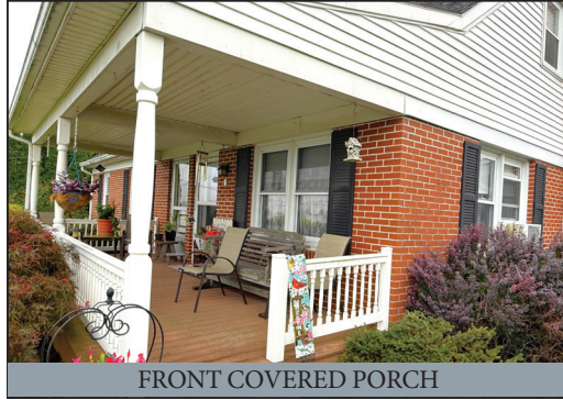
FRONT COVERED PORCH