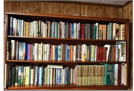
HUNDREDS OF BOOK LOTS

BOOK LISTING: A few hundred lots of books including .....Matthew Henry Commentary 6 vol. set; International Bible Encyclopedia 5 vol. set; Eastern Mennonite Testimony (bound volumes) Volumes 3,4,5,6,7, 1979 – 2004; Christan Contender (bound) 16 volumes 1979-2006; The Treasury of David 3 vol. set; The Reformers and Their Stepchildren; The Church of our Fathers; Ready Scriptural Reasons; Studies in the Sermon on the Mount; 8 vol. McGuffey Readers; 16 vol. Encyclopedia of Gardening; The Prince of the House of David; The Book of Virtues; God and Uncle Dale; There Have to Be Six; River of Glass; Beyond the Trail; J is for Janette; The Drummer's Wife; Children of Ephrata; Out of the Storm; Rod and Staff, CLP, CAM, Pathway and other Publishers. Bound volumes of: Young Companion, Family Life, Country, Birds and Blooms, Wildlife, Keepers at Home, Taste of Home. Much more unlisted. BOOK PREVIEW FRIDAY OCT 17, FROM 3-7 PM