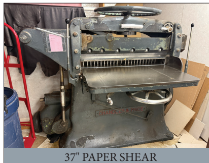
37" PAPER SHEAR