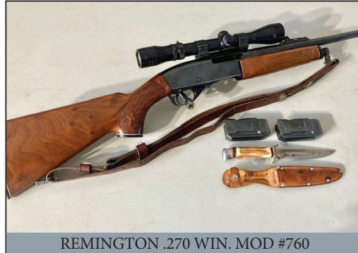
REMINGTON .270 WIN. MOD #760