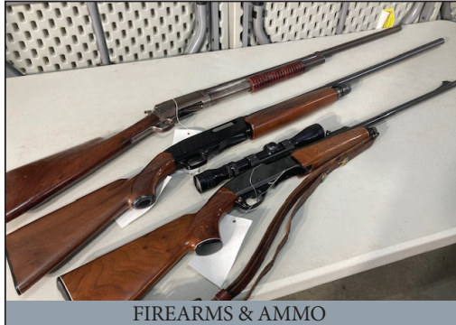
FIREARMS & AMMO

TCM FORKLIFT * MECHANICS POWER TOOLS * WELDER * DRILL PRESS GUNS & AMMO * SK, SNAP-ON & CRAFTSMAN TOOLS * ACETYLENE TORCH TUESDAY, OCTOBER 7, 2025 @ 5:00 PM