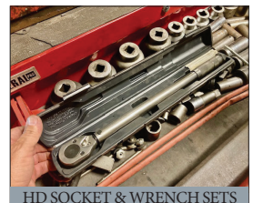
HD SOCKET & WRENCH SETS