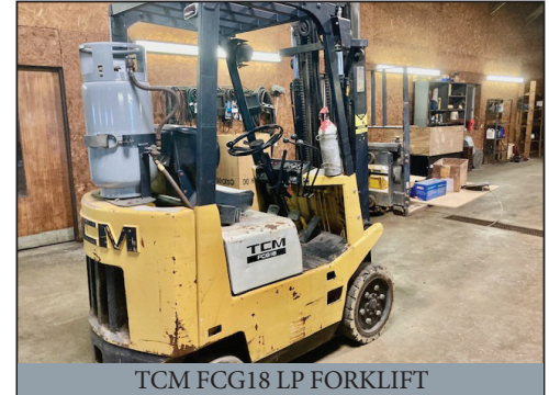
TCM FCG18 LP FORKLIFT

Located at: 1680 Lincoln Rd. Lititz, Pa. 17543