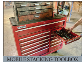
MOBILE STACKING TOOLBOX