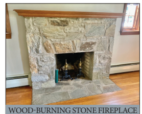
WOOD-BURNING STONE FIREPLACE