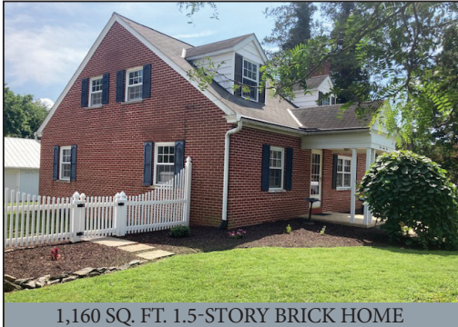
1,160 SQ. FT. 1.5-STORY BRICK HOME

3-BDRM 1-BATH 1.5 STORY BRICK HOME * .90-AC. LOT 34'x27' 3-BAY GARAGE w/LEAN-TO * BORDERS THE MILL CREEK! THURSDAY, SEPT. 18, 2025 @ 6-PM