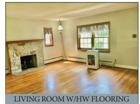
LIVING ROOM W/HW FLOORING