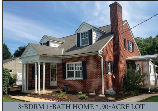
3-BDRM 1-BATH HOME * .90-ACRE LOT