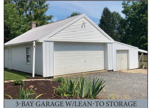
3-BAY GARAGE W/LEAN-TO STORAGE

Located at: 141 Strasburg Pike (Rt. 741) Lancaster, Pa. E. Lampeter Twp. CV Schools.