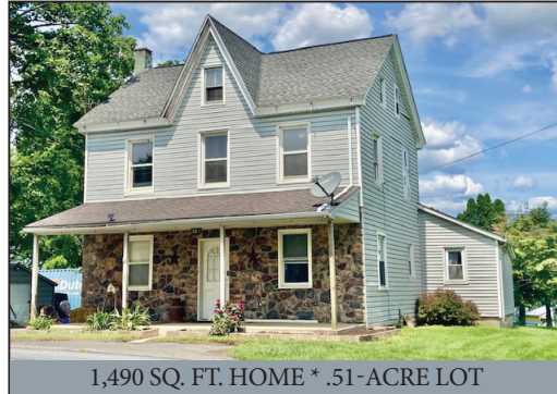
1,490 SQ. FT. HOME * .51-ACRE LOT