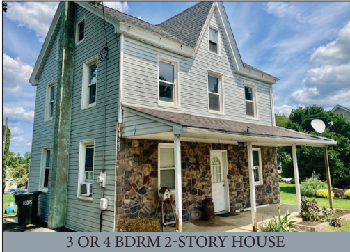
3 OR 4 BDRM 2-STORY HOUSE

3-or-4 BDRM 1-BATH 2-STORY HOME * .51-ACRE LOT DETACHED 18'x25' 1-BAY GARAGE * NEEDS SOME TLC! GREAT RENTAL/INVESTMENT * MID-RENOVATION CONDITION! TUESDAY, SEPT. 16, 2025 @ 6-PM