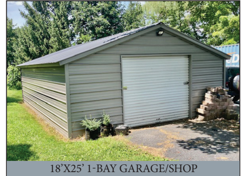
18'X25' 1-BAY GARAGE/SHOP

Located at: 6222 Division Hwy. Narvon, Pa. Caernarvon Twp. Lancaster Co.