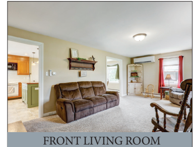
FRONT LIVING ROOM

REAL ESTATE DETAILS: A very clean & updated brick 2-story house w/ attached 1.5-car garage on .38-acre level lot. House was built in 1941; has approx. 1,456 sq. ft. Main level has an updated 24'x 13.5' kitchen/dining area w/ Cherry cabinetry, eat-at island, double-hung windows, appliances, food pantry; 24'x 12' front living room w/ stairway banister; 11'x 9' office or hobby room w/ built-in bookshelves, exposed brick wall & closet; powder bathroom; side entrance mud room; 19'x 18' 1.5-car garage; rear concrete patio for entertaining. Second level has 13'x 12.5' primary bedroom w/ exposed wood flooring & closet; 13'x 9' BR #2 w/ exposed wood flooring; 12.5'x 9.5' BR #3 w/ exposed wood flooring & closet; all BR's have ceiling fan; desirable laundry room w/ storage space & door to 19'x 18' balcony & wash line; updated full bathroom w/ tub shower. Improved 24'x 14' attic space. Semi-improved 25'x 20' basement w/ play area & canning shelves; shower stall. On-site well & septic; Waterfall water softener; UV-light; updated windows; new roof in 2019; new septic system in 2021; oil furnace H/W baseboard; mini-split A/C & heat-pump; 200-amp elec. service; Ephrata Area S.D.; taxes approx. $4,062. A well-maintained property w/ an inviting back yard on a low traffic side street. Come and see how this could fill your real estate needs.