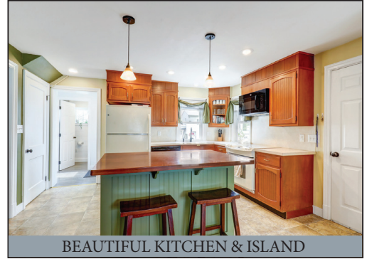
BEAUTIFUL KITCHEN & ISLAND

LOCATED AT: 306 Spring Glen Dr. Ephrata PA * Ephrata Township