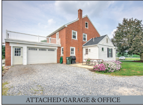
ATTACHED GARAGE & OFFICE