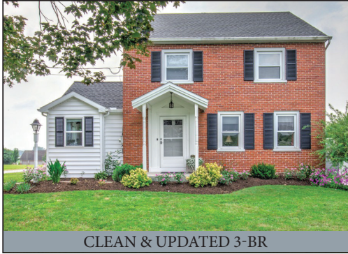
CLEAN & UPDATED 3-BR