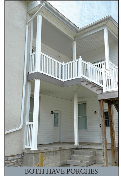
BOTH HAVE PORCHES

LOCATED AT: 136 & 138 West Main Ave. Myerstown, PA 17067