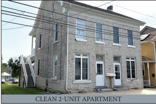
CLEAN 2-UNIT APARTMENT

2-UNIT APARTMENTS * OFF-STREET PARKING BOTH SIDES OF SEMI-DETACHED HOUSE * CLEAN FRIDAY SEPT 19, 2025 @ 6:30 PM