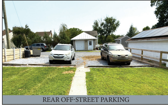
REAR OFF-STREET PARKING