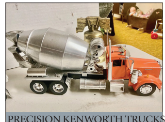
PRECISION KENWORTH TRUCKS