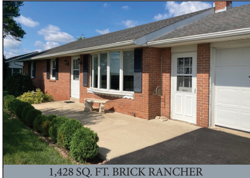
1,428 SQ. FT. BRICK RANCHER

3-BDRM BRICK RANCHER w/2-CAR GARAGE * .40-AC. LOT 2020 CHRYSLER CARAVAN * SNAPPER Z-TURN MOWER * SNOW BLOWER * TOOLS ERTL FARM TOYS * ANTIQUES * MENNO ART ANIMALS * PERSONAL PROPERTY SAT. SEPT. 6, 2025 @ 9-AM/REAL ESTATE @ 1-PM