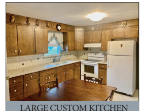
LARGE CUSTOM KITCHEN