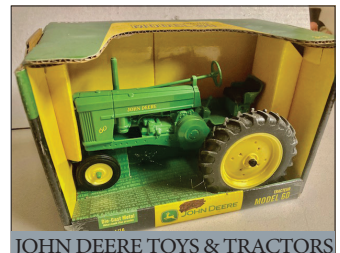
JOHN DEERE TOYS & TRACTORS