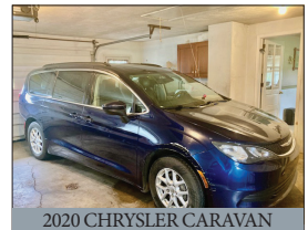
2020 CHRYSLER CARAVAN