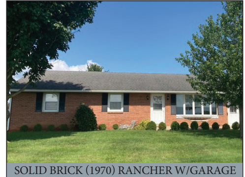
SOLID BRICK (1970) RANCHER W/GARAGE

Located at: 200 Reading Rd. East Earl, Pa. 17519 East Earl Twp. Lancaster Co.