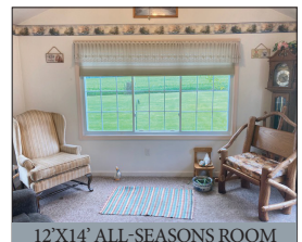
12'X14' ALL-SEASONS ROOM

Open House: SAT. AUG. 16 & 23 from 1-3 PM for info call/text auctioneer @ (717) 371-3333.