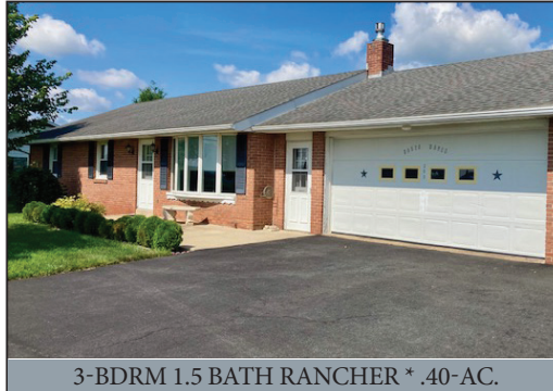
3-BDRM 1.5 BATH RANCHER * .40-AC.