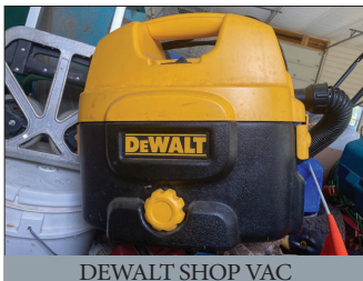
DEWALT SHOP VAC