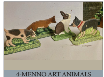
4-MENNO ART ANIMALS