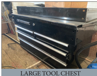
LARGE TOOL CHEST