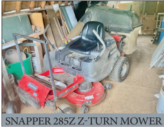
SNAPPER 285Z Z-TURN MOWER

SAT. SEPT. 6, 2025 @ 9-AM/REAL ESTATE @ 1-PM