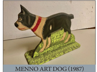
MENNO ART DOG (1987)

Terms: Cash, PA check or credit card w/3% fee; food by Weaverland Valley FC; sale held under tent, bring a chair.