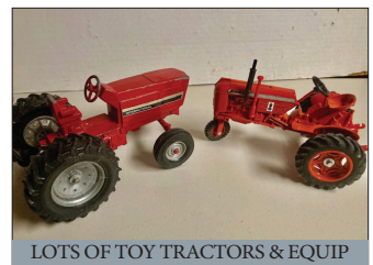
LOTS OF TOY TRACTORS & EQUIP