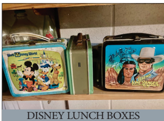
DISNEY LUNCH BOXES