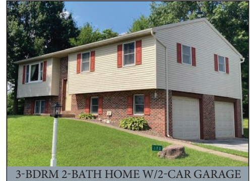
3-BDRM 2-BATH HOME W/2-CAR GARAGE

Located at: 173 Wheatland Dr. Denver, Pa. Brecknock Twp. Lancaster Co.