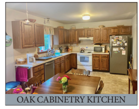
OAK CABINETRY KITCHEN