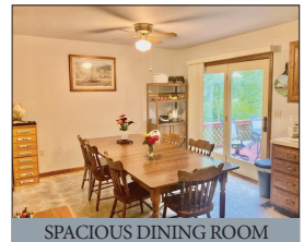
SPACIOUS DINING ROOM

For Photos & Complete Listing Visit www.martinandrutt.com