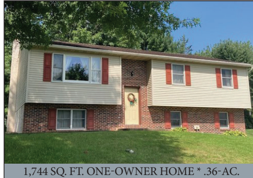
1,744 SQ. FT. ONE-OWNER HOME * .36-AC.