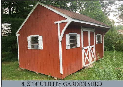
8' X 14' UTILITY GARDEN SHED

3-BDRM 2-BATH 1,744 Sq. Ft. BI-LEVEL HOME * .36-AC LOT ATTACHED 2-CAR GARAGE * 8'x14' UTILITY GARDEN SHED THURSDAY, OCTOBER 9, 2025 @ 6-PM