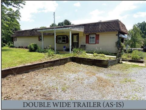
DOUBLE WIDE TRAILER (AS-IS)