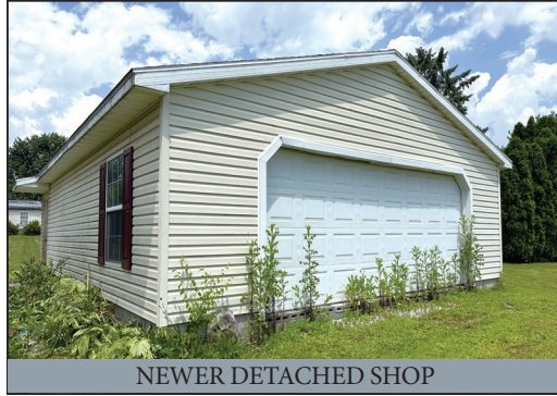
NEWER DETACHED SHOP