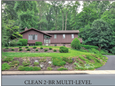
CLEAN 2-BR MULTI-LEVEL