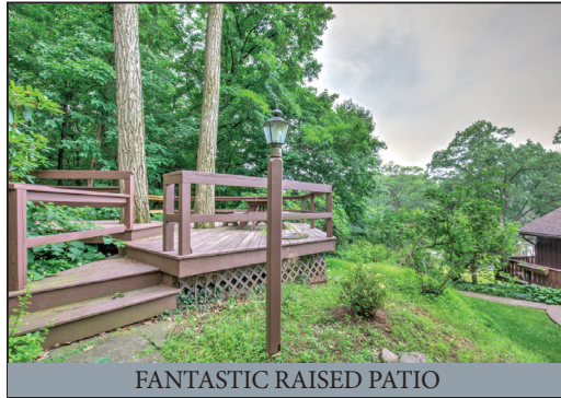
FANTASTIC RAISED PATIO