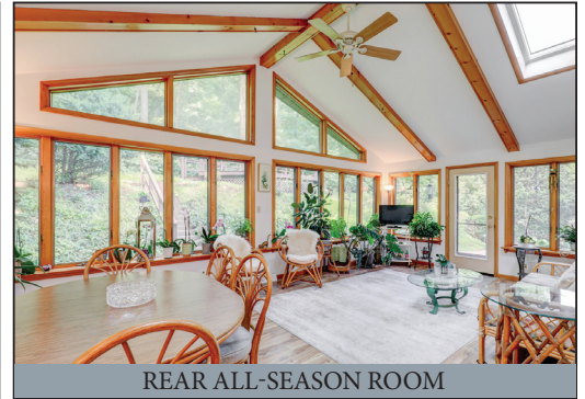
REAR ALL-SEASON ROOM

LOCATED AT: 331 Spring Garden St. Ephrata, PA 17522 * Ephrata Boro