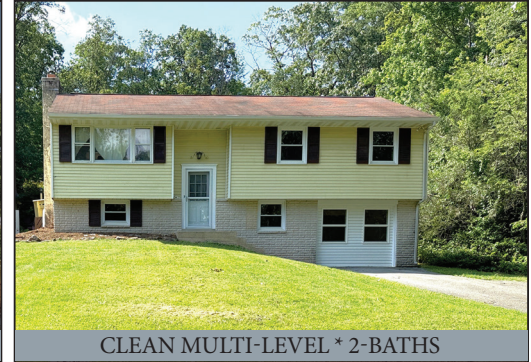
CLEAN MULTI-LEVEL * 2-BATHS

LOCATED AT: 5215 Honeysuckle Ln. New Holland, PA 17557