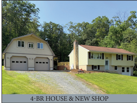
4-BR HOUSE & NEW SHOP