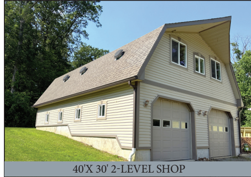
40'X 30' 2-LEVEL SHOP