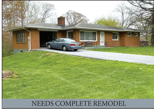
NEEDS COMPLETE REMODEL