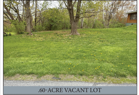
.60-ACRE VACANT LOT

LOCATED AT: 152 E. Church St. Stevens, PA 17578 * E. Cocalico Twp