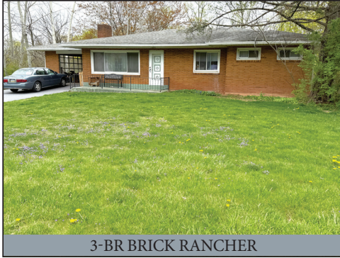
3-BR BRICK RANCHER