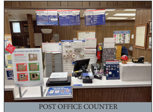
POST OFFICE COUNTER

LOCATED AT: 8 S. Line Rd. Stevens, PA 17578 * West Cocalico Township