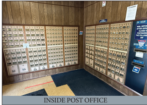
INSIDE POST OFFICE