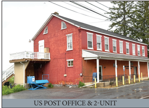
US POST OFFICE & 2-UNIT