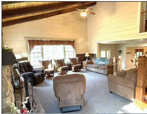
LR FRONT BAY WINDOW