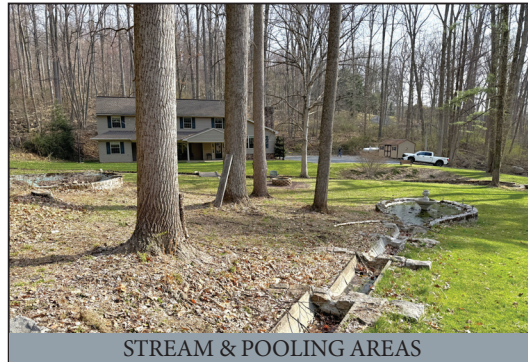
STREAM & POOLING AREAS