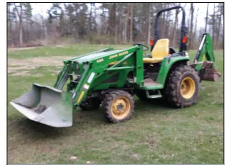
SIT-IN FRONT FOYER

Please visit our website www.martinandrutt.com or Facebook or Instagram