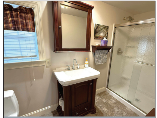
LARGE FULL BATHROOMS