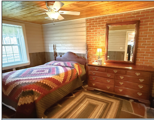
OFFICE OR BEDROOM