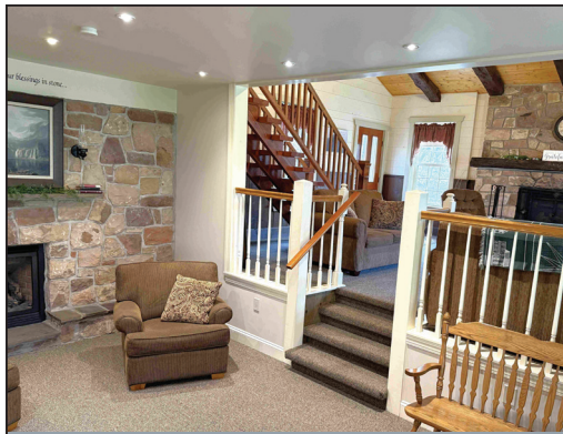
FOYER & LIVING AREA