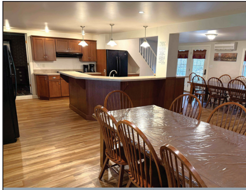
HUGE EAT-IN KITCHEN