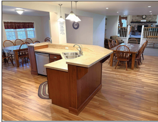
LARGE KITCHEN ISLAND