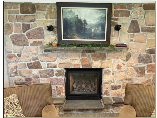
SIT-IN FRONT FOYER

AUCTIONEER NOTE: Truly a must-see property! Front yard has a stone-walled stream and stone pillars for a pavilion (only needs rafters & roof). Beautiful real stone chapel & sitting area. Real stone playhouse (needs TLC), all situated on a secluded 10.3-acre wooded property. Buyer has the option to purchase all furniture after the auction. Property has timber value and excellent Whitetail deer hunting! Shares a property pin with PA Game Land #46. Selling adjoining 18.8-acres also, same evening.