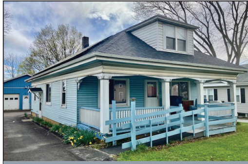
5-BDRM 1-BATH HOME * .39-AC. LOT