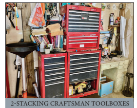
2-STACKING CRAFTSMAN TOOLBOXES

Terms: cash, PA check, credit card w/3% fee. Good food onsite, sale held under tent, bring a chair.