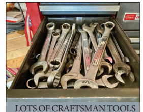
LOTS OF CRAFTSMAN TOOLS