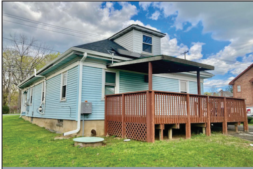
1,596 SQ. FT. 1.5 STORY HOME

5-BDRM 1.5-STORY HOME * 2-BAY SHOP/GARAGE & SHED * .39-AC. LOT MECHANICS TOOLS * 6-TON AUTO LIFT * MOWERS * PERSONAL PROPERTY SAT. JUNE 14, 2025 @ 9-AM/Real Estate @ 1-PM