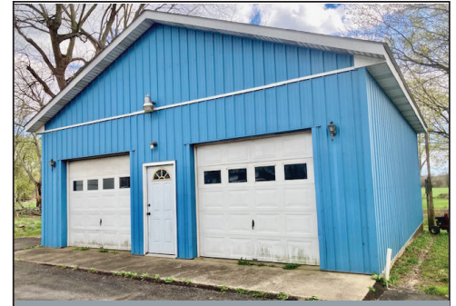
30'X33' 2-BAY SHOP/GARAGE

Located at 2940 Lincoln Hwy. E. Gordonville, Pa. E. Lampeter Twp. Lancaster Co.