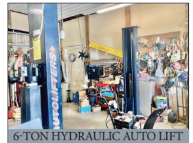
6-TON HYDRAULIC AUTO LIFT