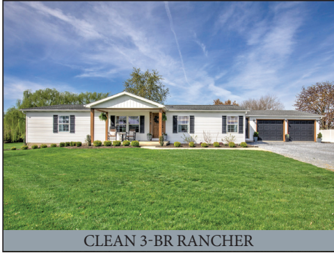
CLEAN 3-BR RANCHER