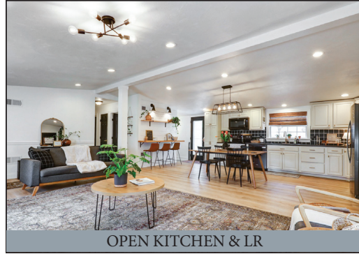
OPEN KITCHEN & LR