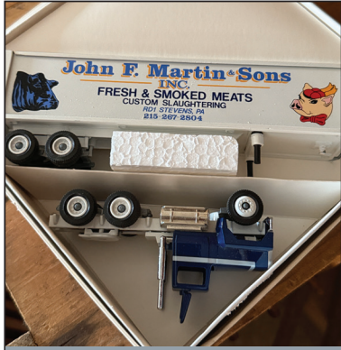
LOCAL WINROSS TRUCKS