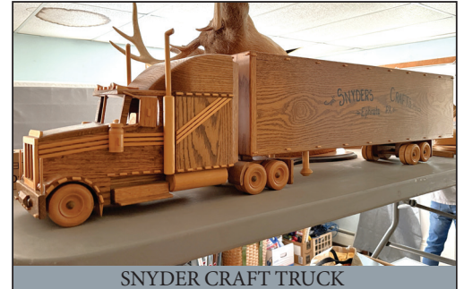
SNYDER CRAFT TRUCK

FURNITURE & APPLIANCES: Whirlpool White fridge; Samsung elec. flat-top stove; Maytag washer; Speed-Queen dryer; Frigidaire 14-cf chest freezer; GE & Haier window air conditioners; White Kitchen-Aid mixer; Oak table w/ (13) boards & (6) chip-carved chairs; Oak 4-door hutch; Oak 1-door cabinet; Oak 2-door cabinet; Oak 2-pc desk; Oak 10-gun cabinet w/ key; Oak toy box; Oak high book shelf; Oak step stool; Oak console table; Oak sewing machine cabinet; Oak clothes tree; Oak mag. rack; drop-leaf table & (14) boards; Cherry 3-drawer night stand; Blue elec recliner; Green reclining sofa; Tan reclining sofa; floral rocker/recliner; Cherry queen-size panel bed; queen size mattress & boxspring (memory-foam); child's rocker; Cedar chest; Maple corner desk w/ hutch top; queen two-pc boxsprings; Schwinn exc. Bike; metal file cabinet; antique church bench; new furniture hardware; (6) flat carts; more unlisted furniture.