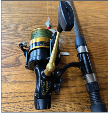
SALT-WATER RODS & REELS