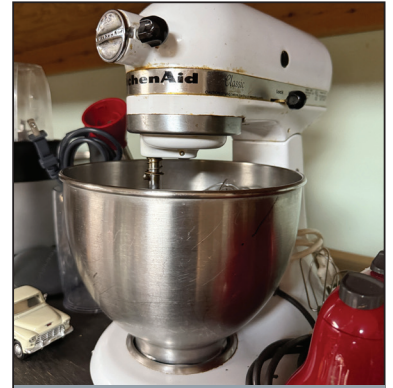
KITCHEN AID MIXER