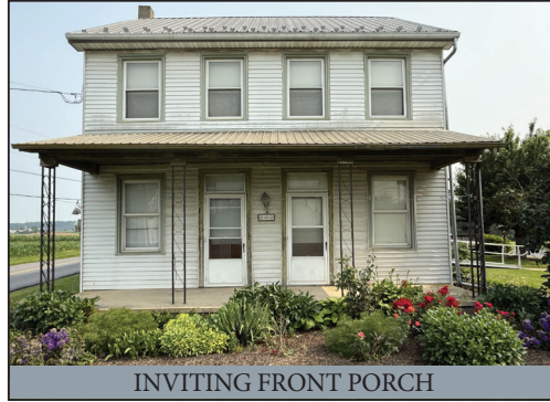
INVITING FRONT PORCH