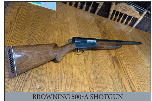
BROWNING 500-A SHOTGUN