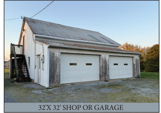
32'X 32' SHOP OR GARAGE

LOCATED AT: 202 Martindale Rd. Ephrata, PA 17522 * Ephrata Township