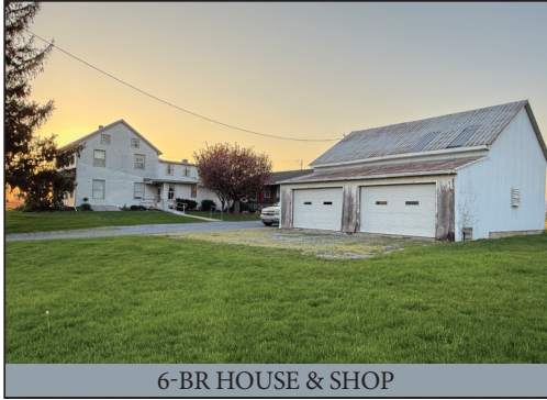
6-BR HOUSE & SHOP