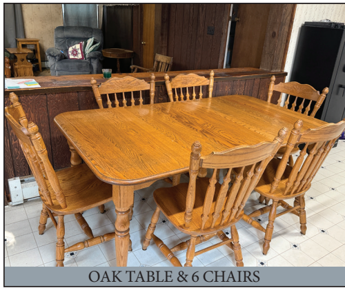
OAK TABLE & 6 CHAIRS