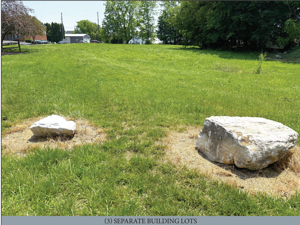
(3) SEPARATE BUILDING LOTS